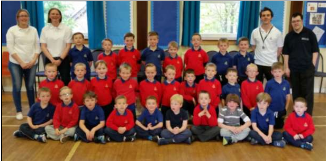
Our big Anchor Boys Section on the last night of the session