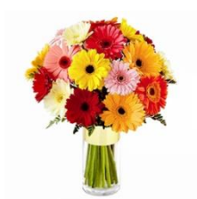
June Graham - Flower Convenor