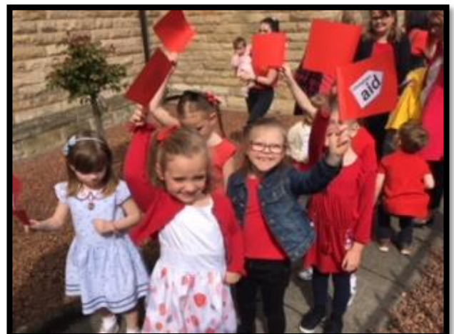
Our Junior Church on Christian Aid Sunday