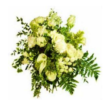
June Graham - Flower Convener