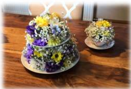
Rosaline's floral delights at the Guild Zoom meeting.