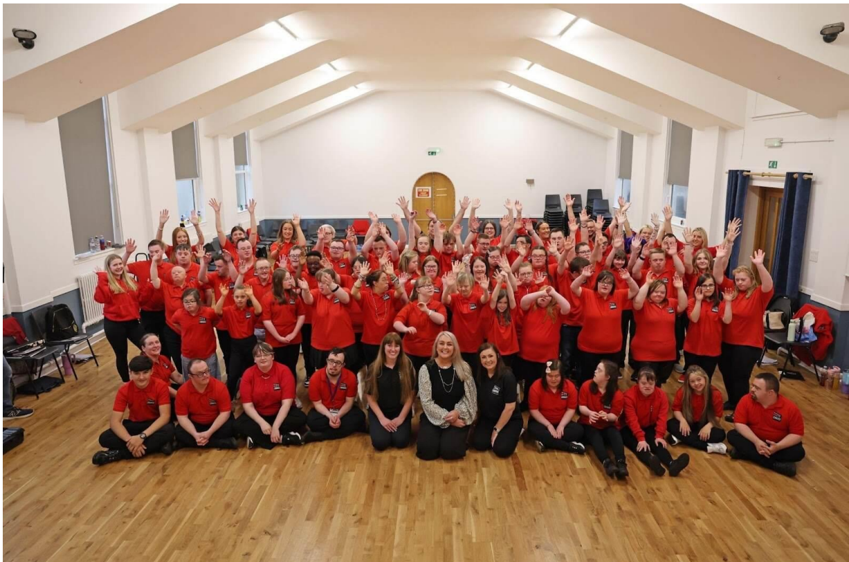
The Award-winning Ups and Downs Theatre Group